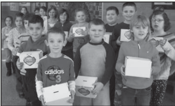
Bogart Elementary dedicated a week in February for the "Pennies for Patients" campaign. Students collected pennies and other spare change in the amount of $350 to benefit the Lymphoma and Leukemia Society.

Visit our website at: www.margarettta.k12.oh.us